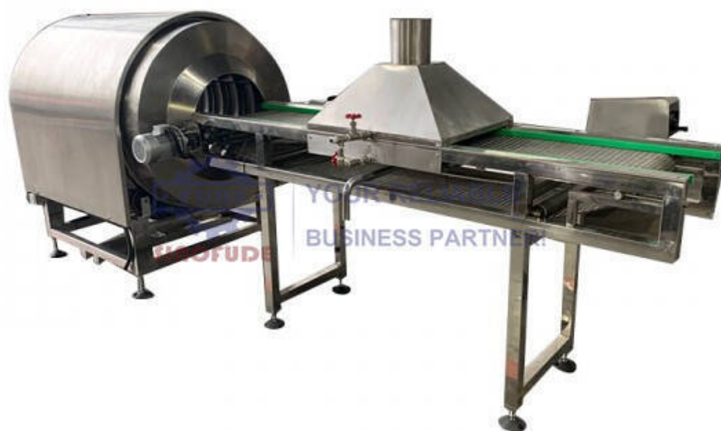
Sugar Coating Machine (Sugar Sanding Machine)