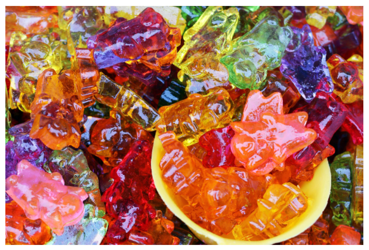
Why Invest In Gummy Bear Machines