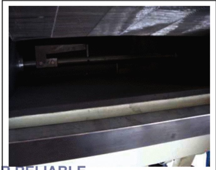
SMALL CHOCOLATE MIXING TANK